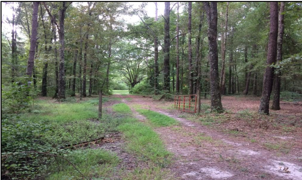
View of access road/driveway into subject from Weaver Road