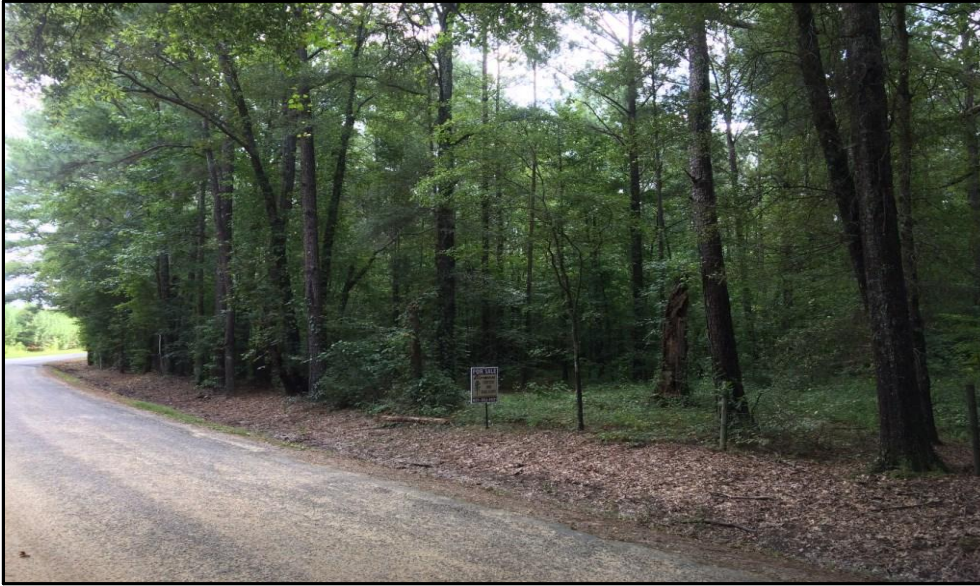
View of Subject along south side of Weaver Road