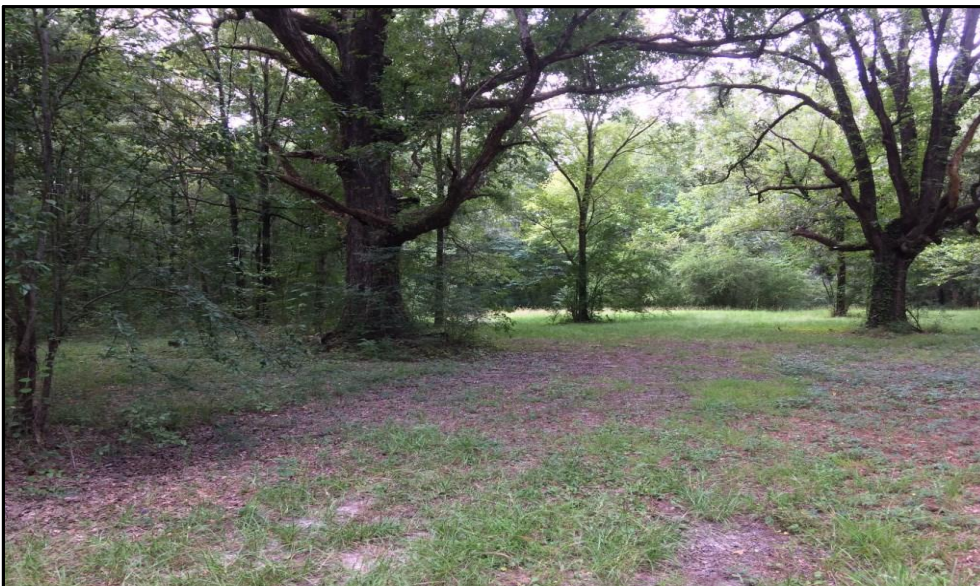
View of homesite